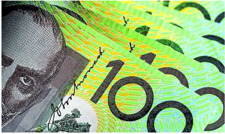
The bond market is getting twitchy and nervous about higher interest rates in the US but is there a liquidity problem?